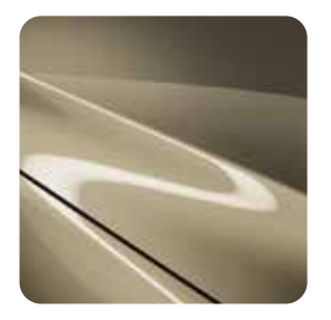
Zircon Sand Metallic