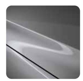
Aero Grey Metallic