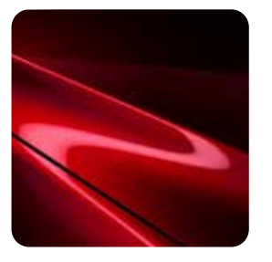
Soul Red Crystal Metallic