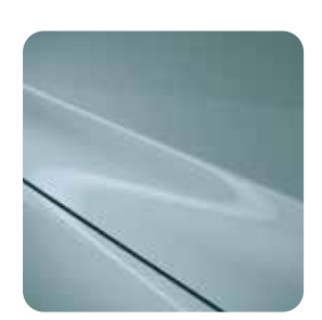
Air Stream Blue Metallic