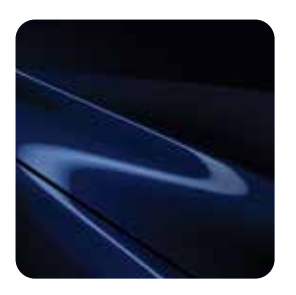
Deep Crystal Blue Mica