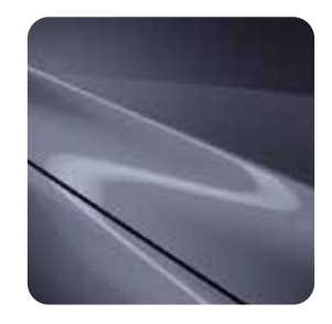
Polymetal Grey Metallic