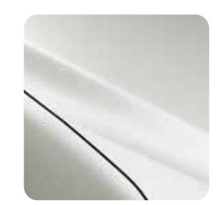
Rhodium White Premium