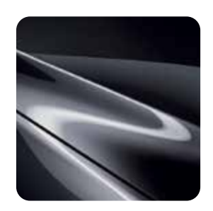
Machine Grey Metallic