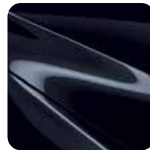
Jet Black Mica