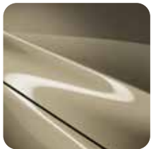
Zircon Sand Metallic