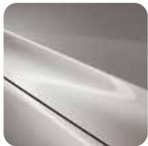
Platinum Quartz Metallic