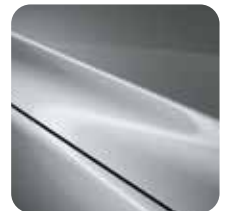
Sonic Silver Metallic