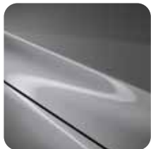
Aero Grey Metallic