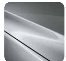
Sonic Silver Metallic