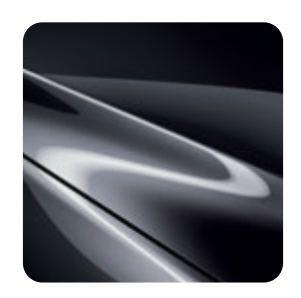
Machine Grey Metallic