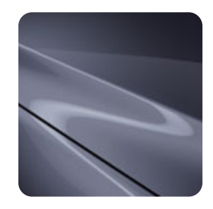
Polymetal Grey Metallic