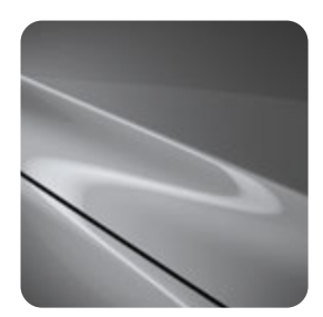
Aero Grey Metallic