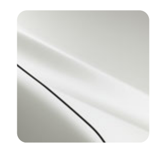
Rhodium White Premium