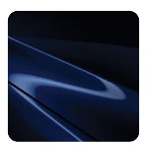
Deep Crystal Blue Mica