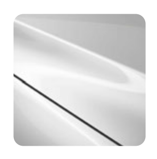
Snowflake White Pearl Mica