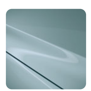
Air Stream Blue Metallic