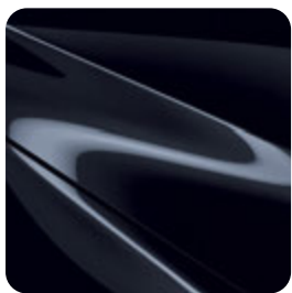
Jet Black Mica