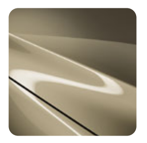
Zircon Sand Metallic