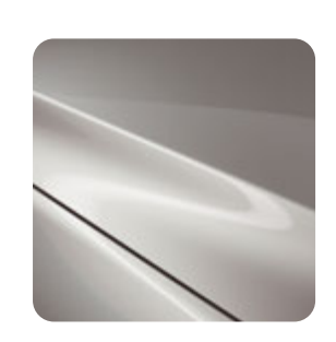
Platinum Quartz Metallic