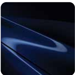
Deep Crystal Blue Mica