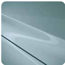
Air Stream Blue Metallic