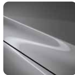
Aero Grey Metallic