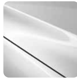
Snowflake White Pearl Mica