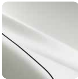
Rhodium White Premium