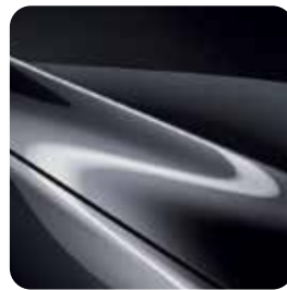
Machine Grey Metallic