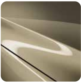
Zircon Sand Metallic