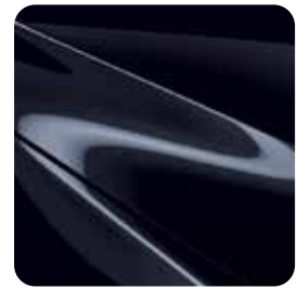
Jet Black Mica