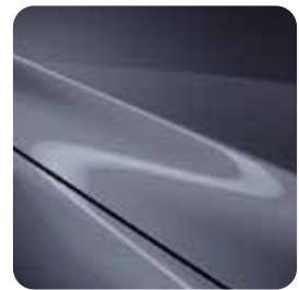
Polymetal Grey Metallic