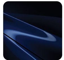
Deep Crystal Blue Mica