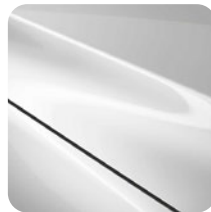
Snowflake White Pearl Mica