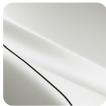
Rhodium White Metallic