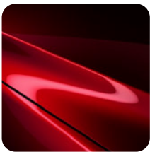
Soul Red Crystal Metallic