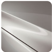
Platinum Quartz Metallic