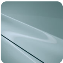
Air Stream Blue Metallic