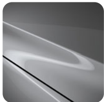
Aero Grey Metallic