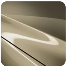
Zircon Sand Metallic