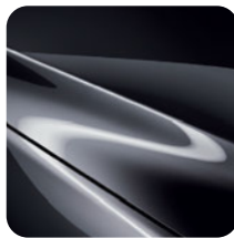
Machine Grey Metallic