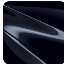
Jet Black Mica