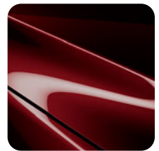
Artisan Red Metallic