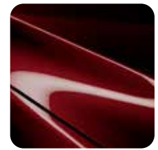
Artisan Red Metallic