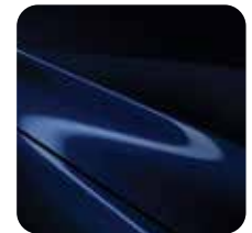
Deep Crystal Blue Mica